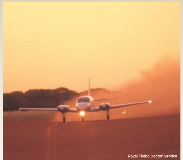
Royal Flying Doctor Service

of outback travel. Check out the restored locomotive and carriages. The museum is open daily 9am -5pm.